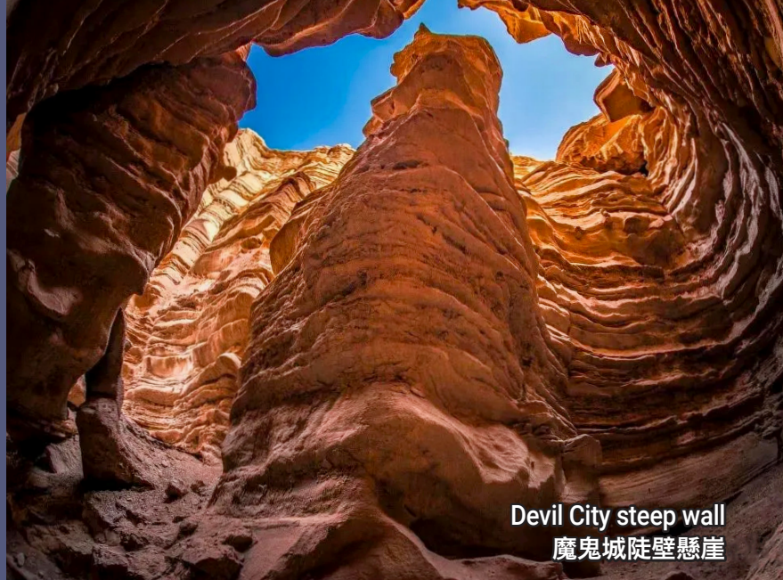
Devil City steep wall 魔鬼城陡壁懸崖