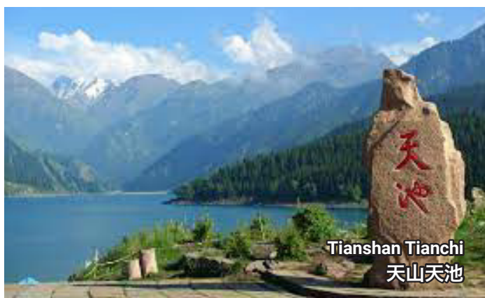
Tianshan Tianchi 天山天池