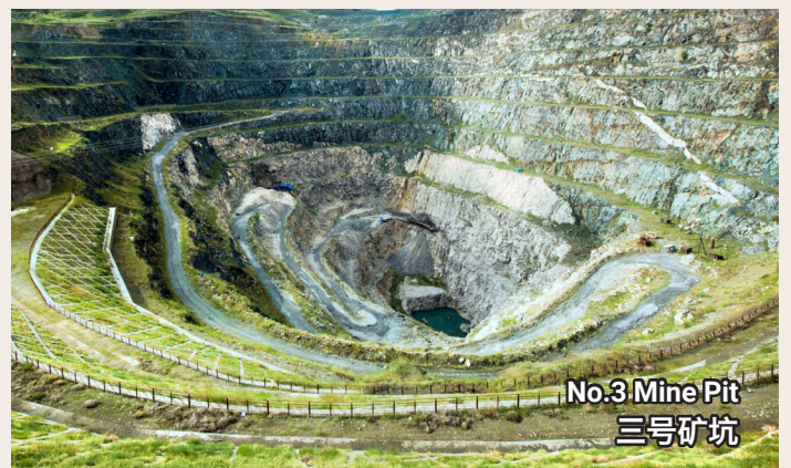
No.3 Mine Pit 三号矿坑