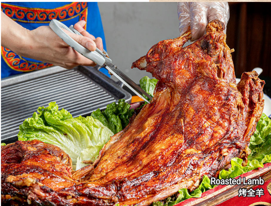
Roasted Lamb 烤全羊