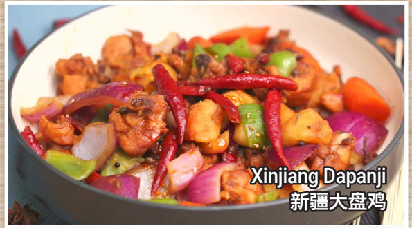
Xinjiang Dapanji 新疆大盘鸡