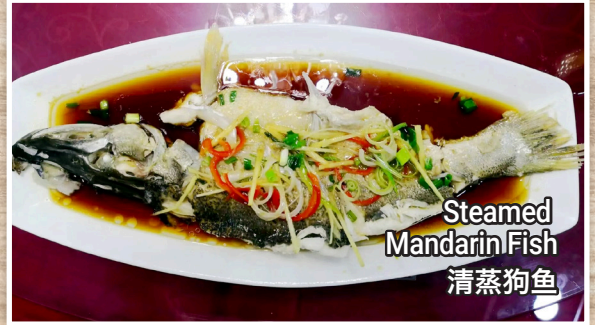
Steamed Mandarin Fish 清蒸狗鱼