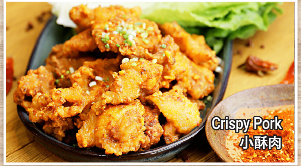
Crispy Pork 小酥肉