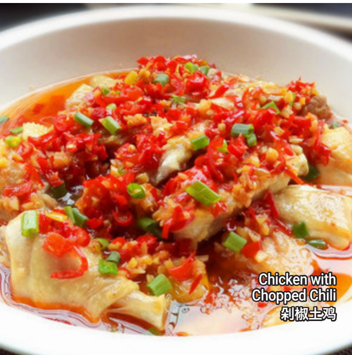
Chicken with Chopped Chili 剁椒土鸡