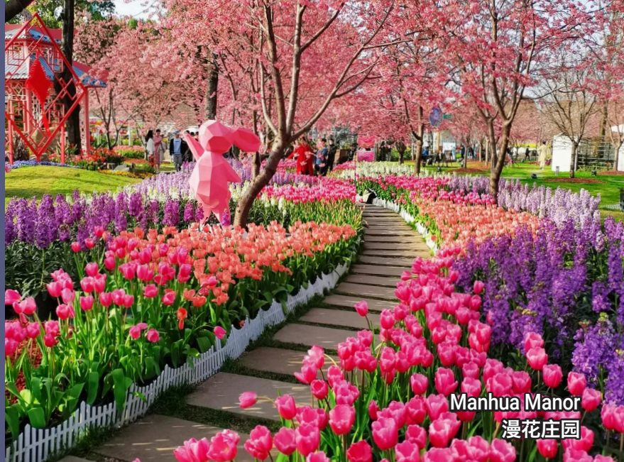
Manhua Manor 漫花庄园

Flowers vary subject to season * 花卉种类视季节而定 *