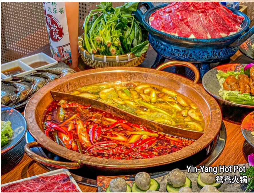
Yin-Yang Hot Pot 鸳鸯火锅