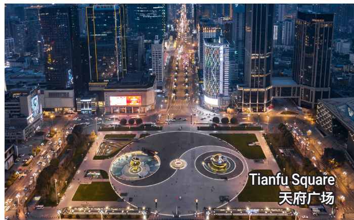
Tianfu Square 天府广场

* 行程次序以当地旅行社安排为准。 * 行程、膳食、住宿、交通等可能会因不可抗力因素而变动，恕不另行通知。 * 图片仅供参考。