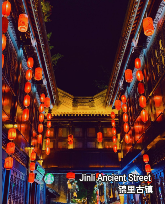
Jinli Ancient Street 锦里古镇