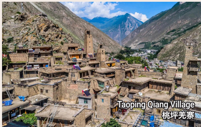
Taoping Qiang Village 桃坪羌寨