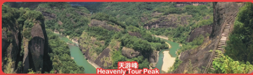
天游峰 Heavenly Tour Peak