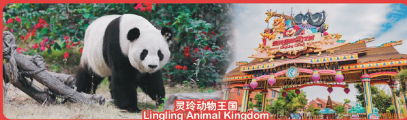
灵玲动物王国 Lingling Animal Kingdom