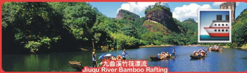
九曲溪竹筏漂流 Jiuqu River Bamboo Rafting