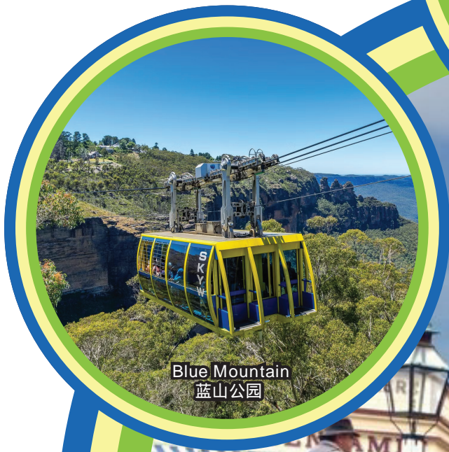
Blue Mountain 蓝山公园