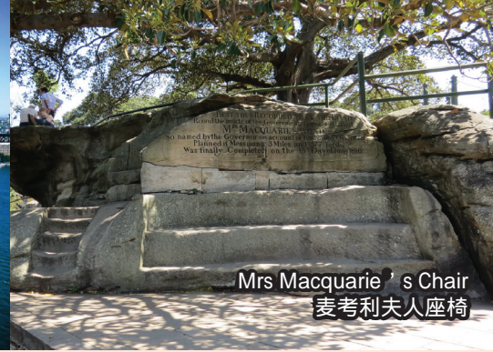
Mrs Macquarie's Chair 麦考利夫人座椅