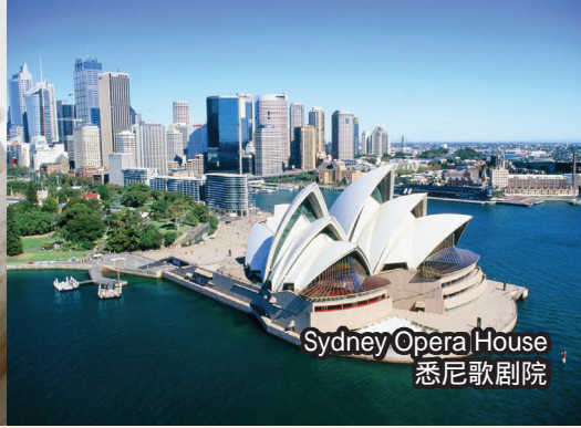
Sydney Opera House 悉尼歌剧院