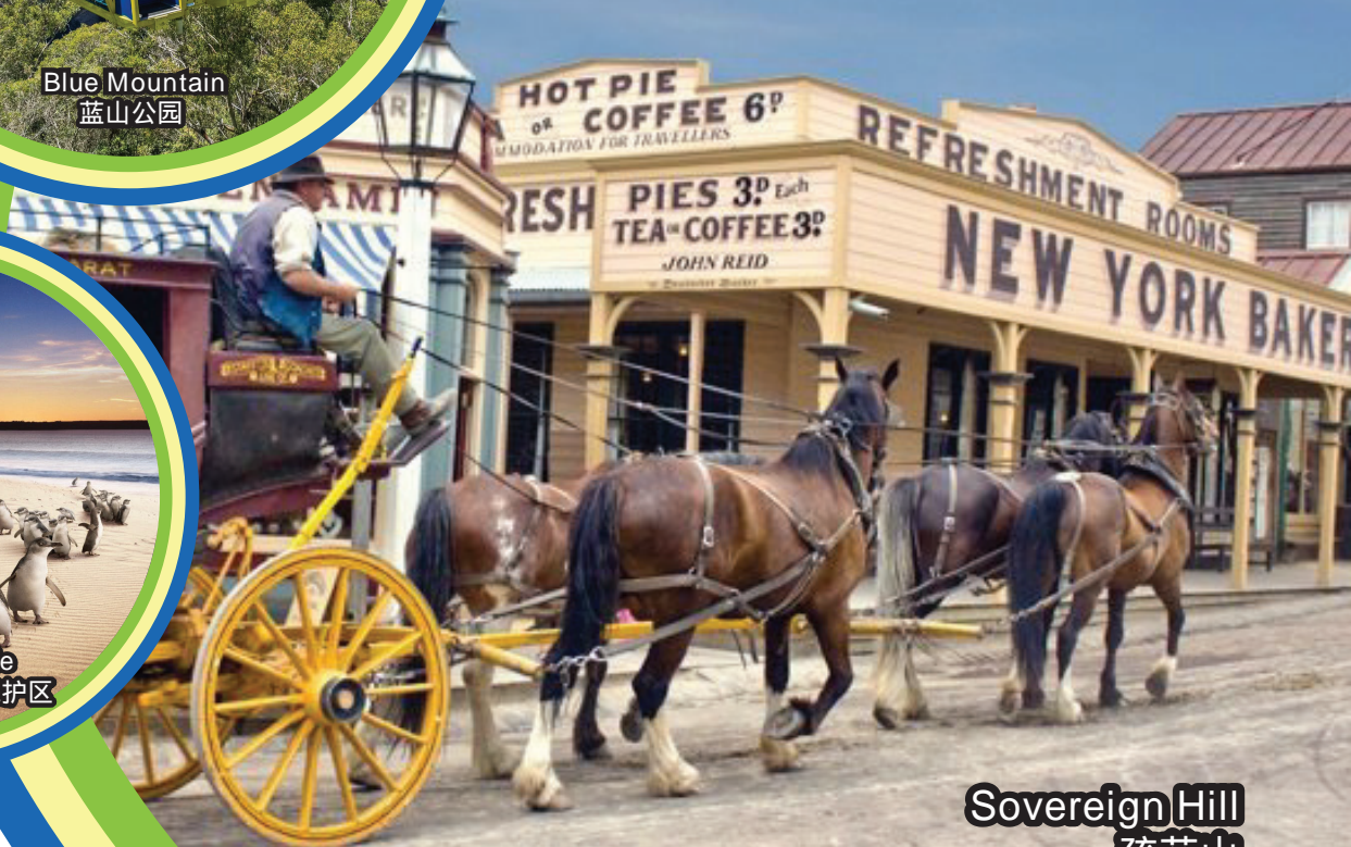
Sovereign Hill 疏芬山

行程次序，以当地旅社安排为准。 Sequences of Itinerary are subject to local arrangement.