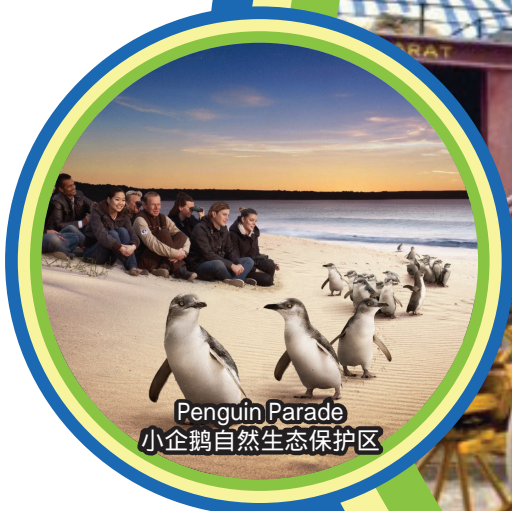
Penguin Parade 小企鹅自然生态保护区