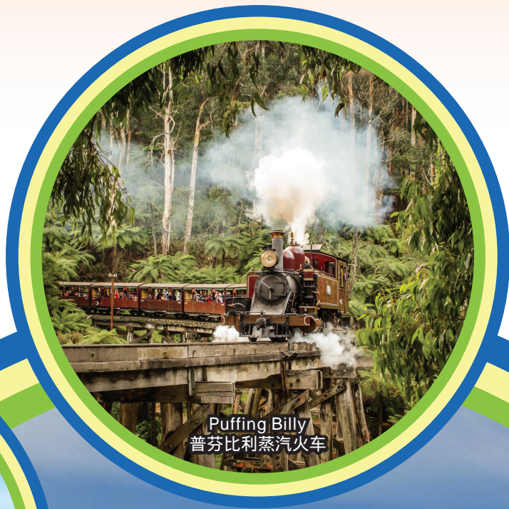
Puffing Billy 普芬比利蒸汽火车