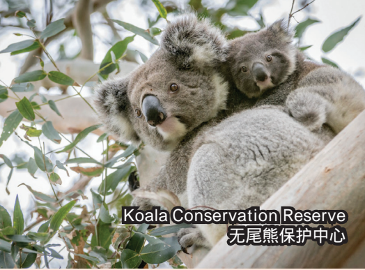
Koala Conservation Reserve 无尾熊保护中心