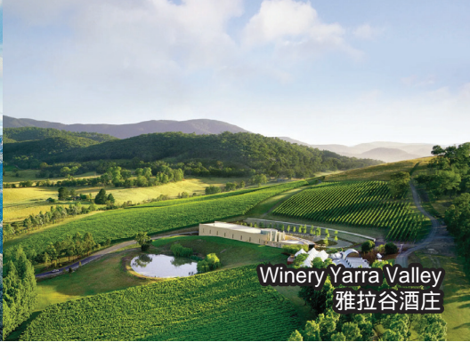
Winery Yarra Valley 雅拉谷酒庄