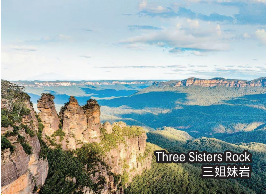
Three Sisters Rock 三姐妹岩