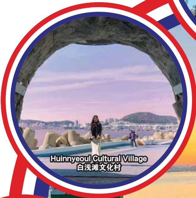
Huinnyeoul Cultural Village 白浅滩文化村