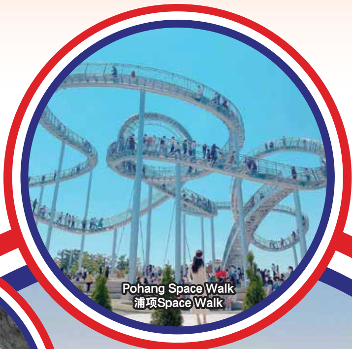
Pohang Space Walk 浦项Space Walk