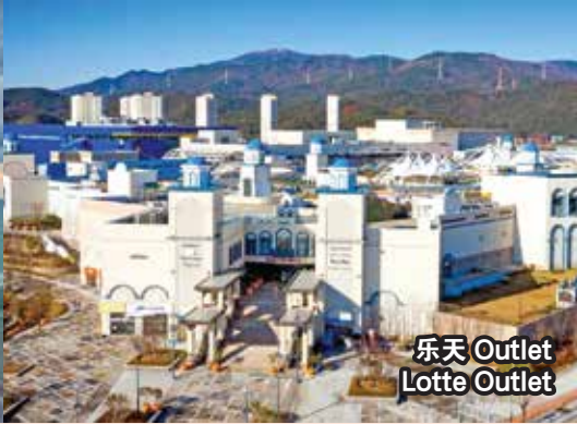
乐天 Outlet Lotte Outlet