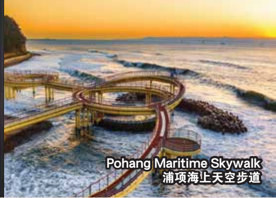
Pohang Maritime Skywalk 浦项海上天空步道