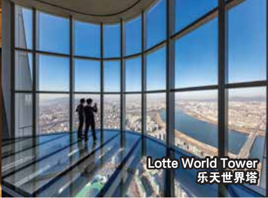
Lotte World Tower 乐天世界塔