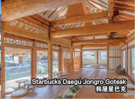
Starbucks Daegu Jongro Goteak 韩屋星巴克