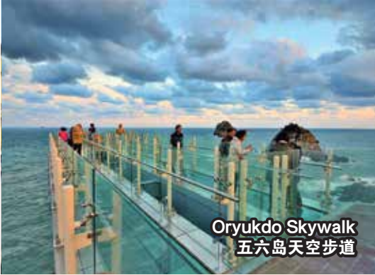
Oryukdo Skywalk 五六岛天空步道