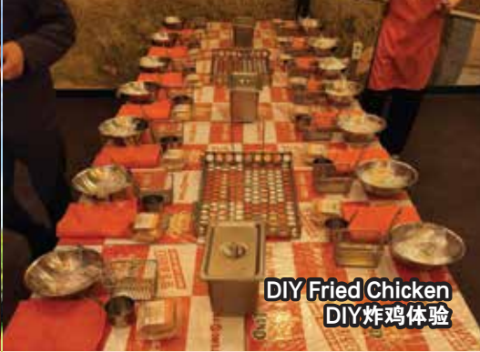
DIY Fried Chicken DIY炸鸡体验