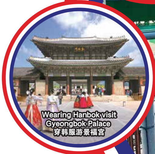
Wearing Hanbok visit Gyeongbok Palace 穿韩服游景福宫

行程次序，以当地旅社安排为准。 Sequences of Itinerary are subject to local arrangement.