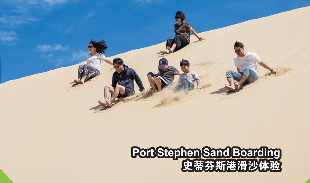
Port Stephen Sand Boarding 史蒂芬斯港滑沙体验

行程次序，以当地旅社安排为准。 Sequences of Itinerary are subject to local arrangement.