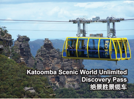
Katoomba Scenic World Unlimited Discovery Pass 绝景胜景缆车