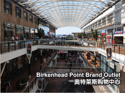
Birkenhead Point Brand Outlet 奥特莱斯购物中心