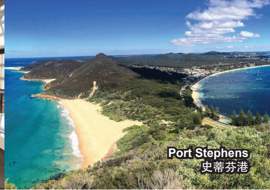
Port Stephens 史蒂芬港