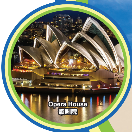
Opera House 歌剧院