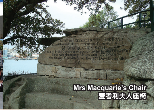
Mrs Macquarie's Chair 麦考利夫人座椅