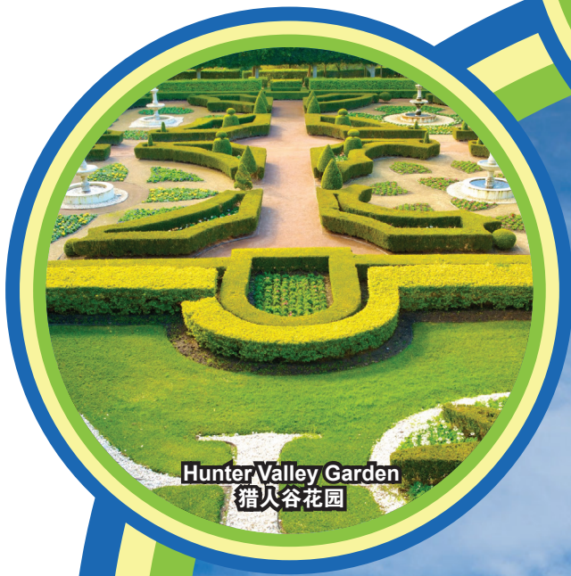
Hunter Valley Garden 猎人谷花园