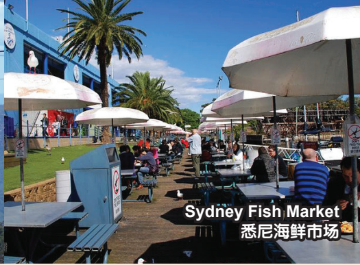
Sydney Fish Market 悉尼海鲜市场