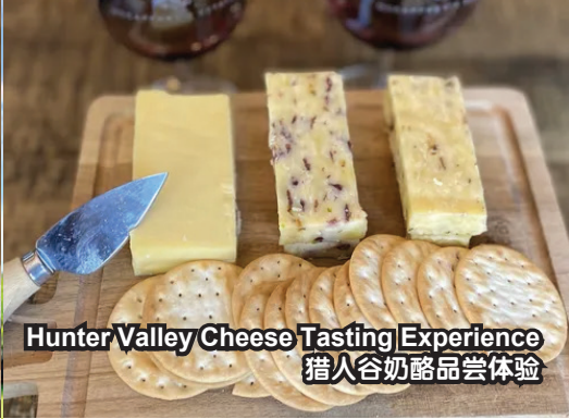
Hunter Valley Cheese Tasting Experience 猎人谷奶酪品尝体验