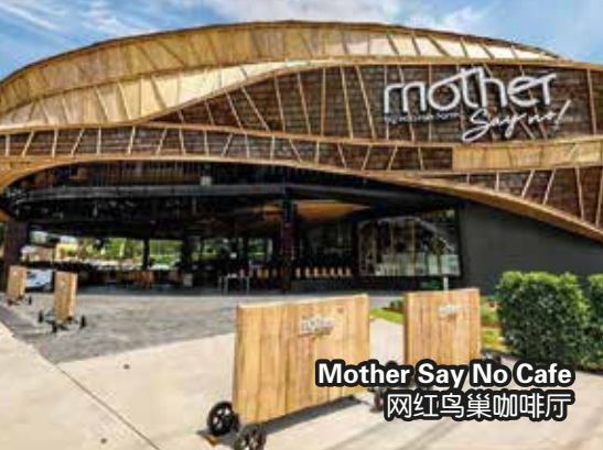
Mother Say No Cafe 网红鸟巢咖啡厅