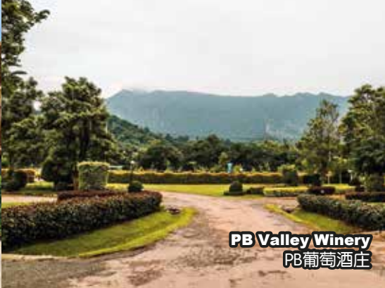
PB Valley Winery PB葡萄酒庄