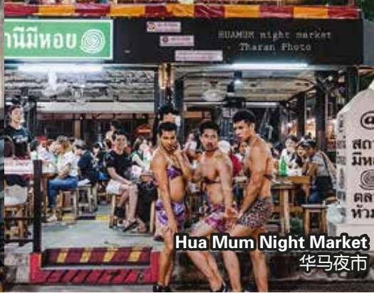
Hua Mum Night Market 华马夜市