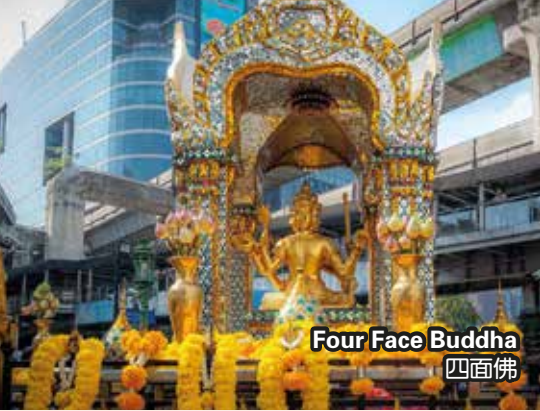
Four Face Buddha 四面佛