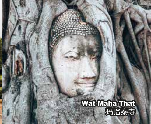
Wat Maha That 玛哈泰寺