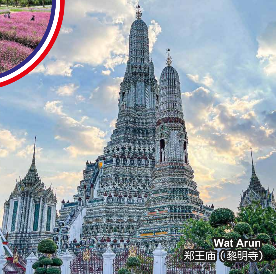
Wat Arun 郑王庙（黎明寺）

行程次序，以当地旅社安排为准。 Sequences of Itinerary are subject to local arrangement.