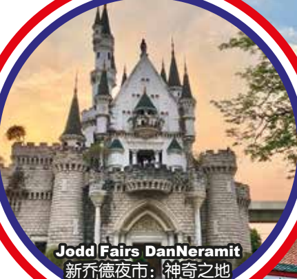
Jodd Fairs DanNeramit 新乔德夜市：神奇之地