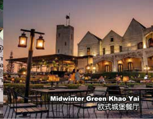
Midwinter Green Khao Yai 欧式城堡餐厅