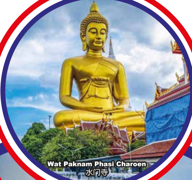
Wat Paknam Phasi Charoen 水门寺