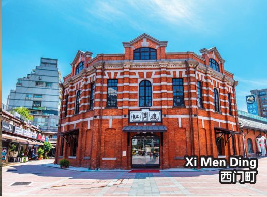
Xi Men Ding 西门町