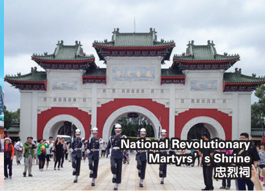
National Revolutionary Martyrs' Shrine 忠烈祠