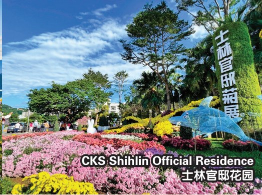
CKS Shihlin Official Residence 士林官邸花园