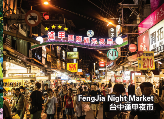
FengJia Night Market 台中逢甲夜市