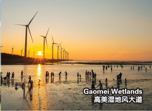
Gaomei Wetlands 高美湿地风大道