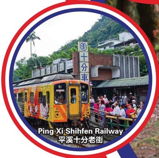
Ping Xi Shihfen Railway 平溪十分老街