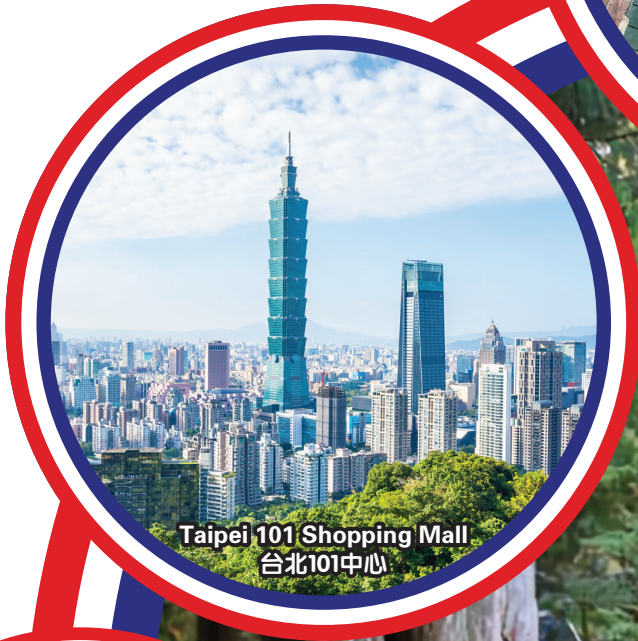
Taipei 101 Shopping Mall 台北101中心