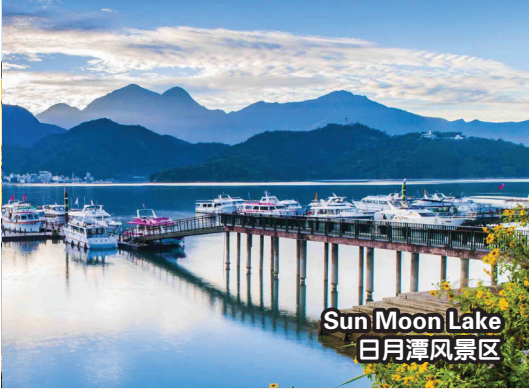
Sun Moon Lake 日月潭风景区