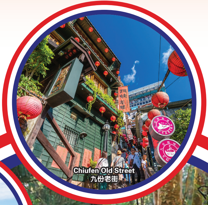
Chiufen Old Street 九份老街