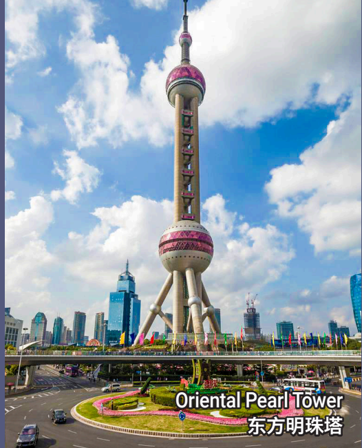
Oriental Pearl Tower 东方明珠塔