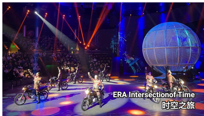
ERA Intersection of Time 时空之旅