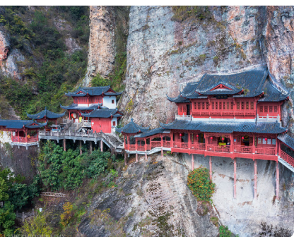
大慈岩 Daci Rock

千岛湖国家级风景名胜区的的重要组成部分。它以“山青、水清、史悠、境幽”为特色，是富春江风光的精华。2000年被授予“全国绿色通道示范段”，在旅游界有“小三峡”之称。