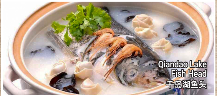
Qiandao Lake Fish Head 千岛湖鱼头