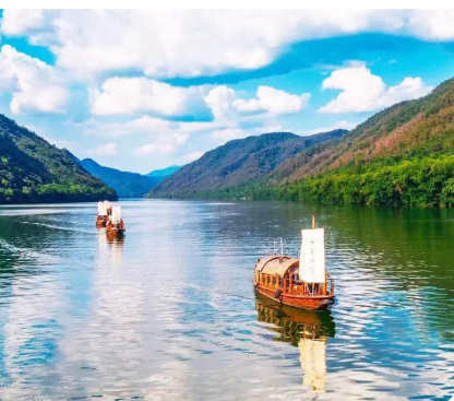
七里扬帆风景区 Qili Yangfan Scenic Area

江南四大古镇之一，1300年建镇史的江南水乡古镇，全国环境优美乡镇，中国首批十大历史文化名镇和中国魅力名镇之一，素有“中国最后的枕水人家”之誉。