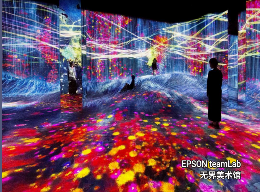
EPSON teamLab 无界美术馆