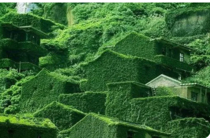
枸杞岛 Gouqi Island

It is known as the "Little Greece" of the East, with green castles and a fairytale world, and is also called the "Green Wonderland". In early January 2016, it was named one of the 28 abandoned beautiful sites in the world by the Daily Mail in the UK.