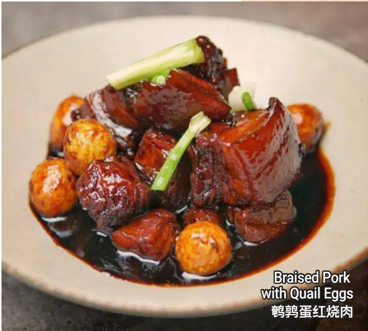
Braised Pork with Quail Eggs 鹤鹑蛋红烧肉