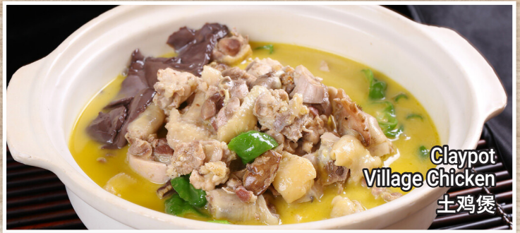
Claypot Village Chicken 土鸡煲