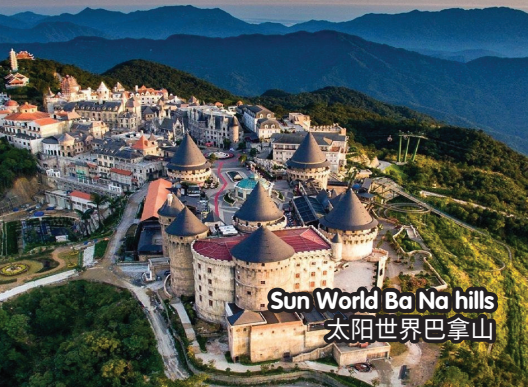
Sun World Ba Na hills 太阳世界巴拿山