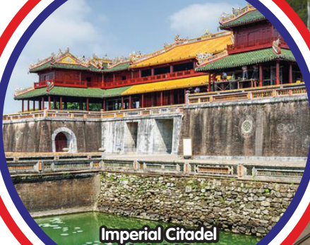
Imperial Citadel 大内皇城

行程次序，以当地旅社安排为准。 Sequences of Itinerary are subject to local arrangement.