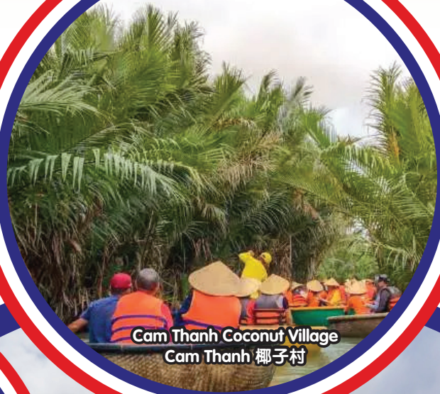
Cam Thanh Coconut Village Cam Thanh 椰子村