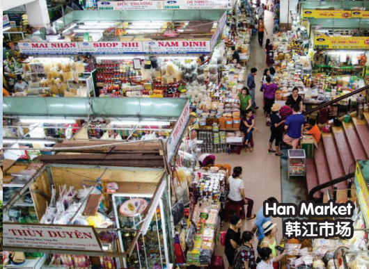
Han Market 韩江市场