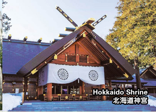
Hokkaido Shrine 北海道神宫