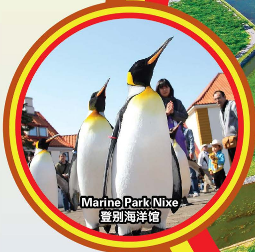
Marine Park Nisei 登别海洋馆