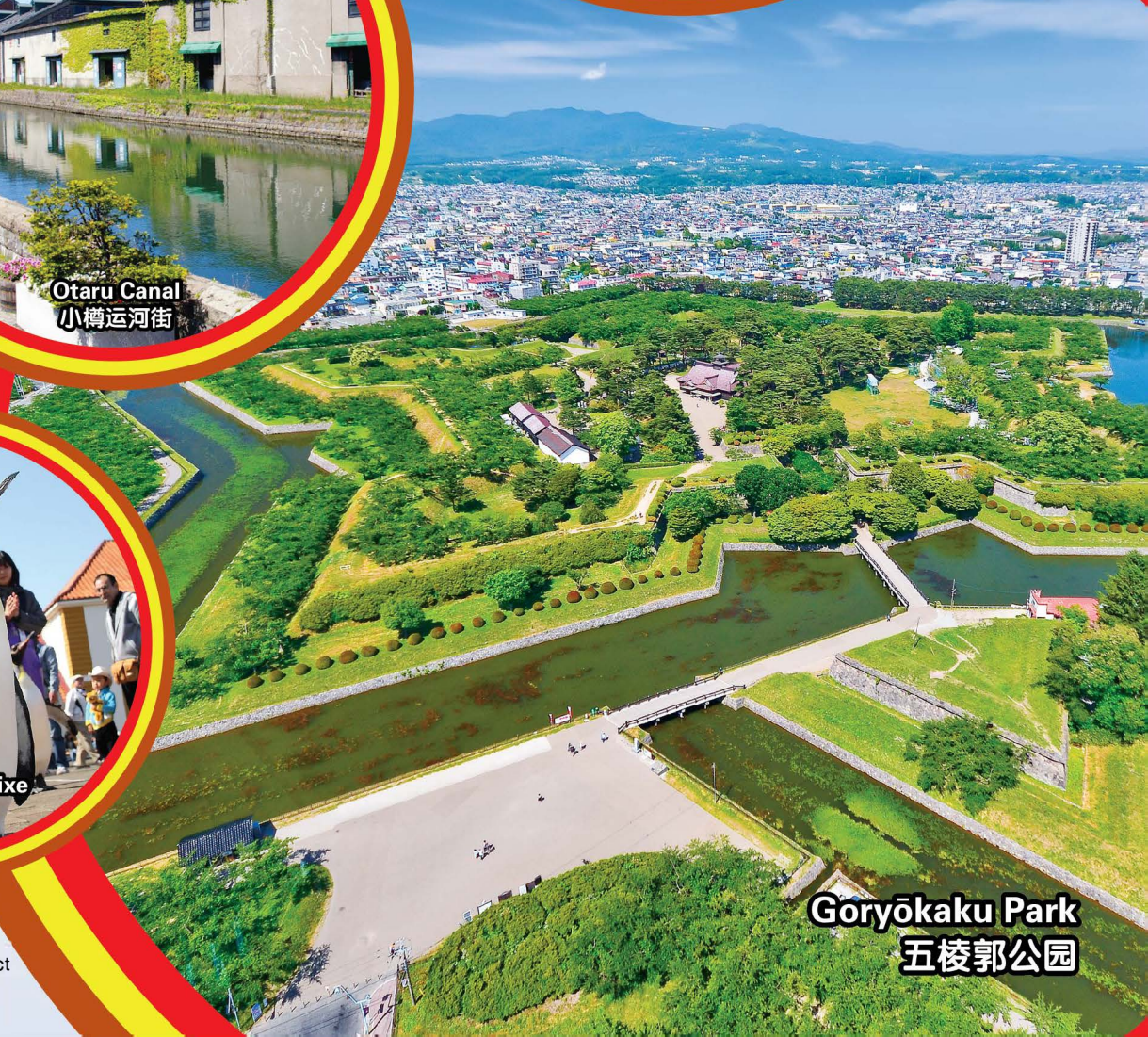
Goryōkaku Park 五稜郭公园

行程次序·以当地旅社安排为准。 Sequences of Itinerary are subject to local arrangement.