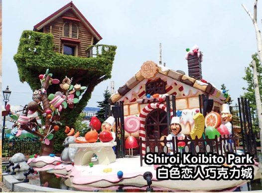
Shiroi Koibito Park 白色恋人巧克力城