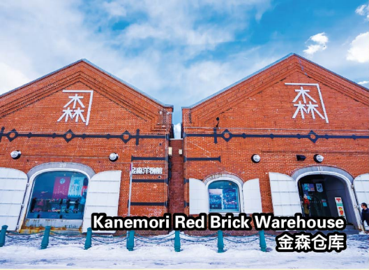
Kanemori Red Brick Warehouse 金森仓库