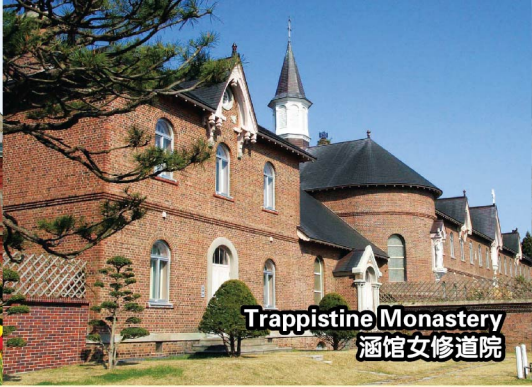
Trappistine Monastery 函館女修道院