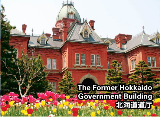
The Former Hokkaido Government Building 北海道庁