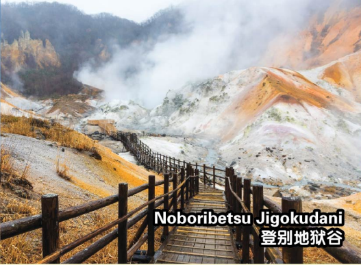
Noboribetsu Jigokudani 登别地狱谷