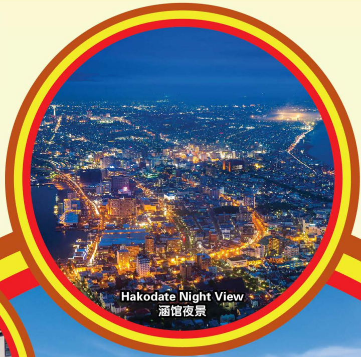
Hakodate Night View 函馆夜景