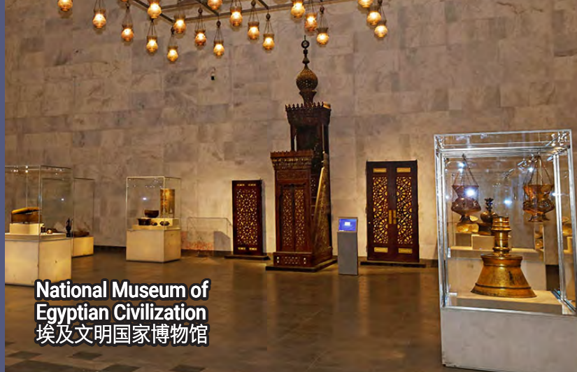
National Museum of Egyptian Civilization 埃及文明国家博物馆