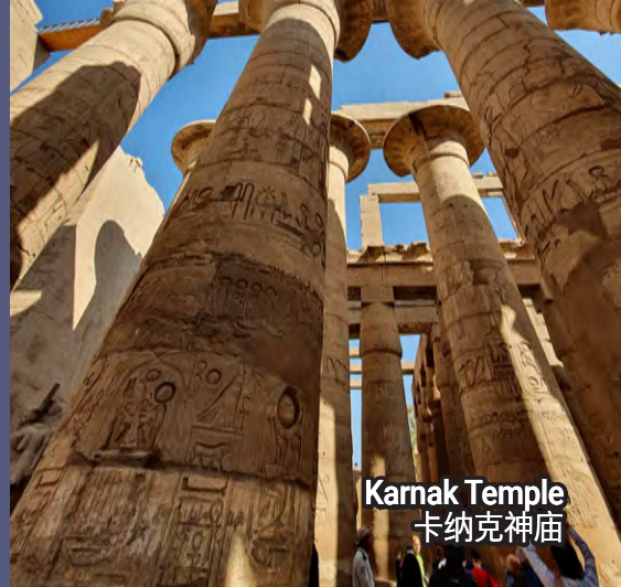
Karnak Temple 卡纳克神庙