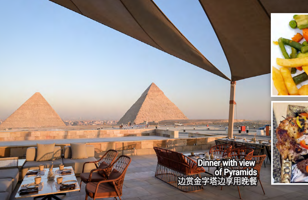
Dinner with view of Pyramids 边赏金字塔边享用晚餐