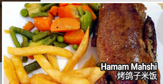
Hamam Mahshi 烤鸽子米饭